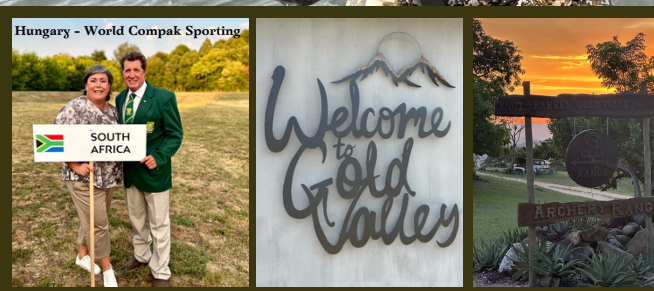
Gold Valley Lodge Gun Club & Mountain Venue Nelspruit Mpumalanga