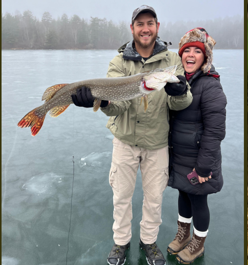
'Minnesota Ice Fishing on Honeymoon '